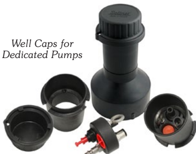
Well Caps for Dedicated Pumps